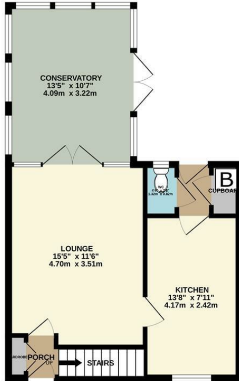
GROUND FLOOR 493 sq.ft. (45.8 sq.m.) approx.